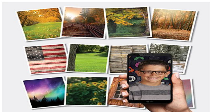
HUNDREDS OF BACKGROUNDS