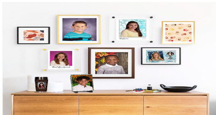
HOME DÉCOR & WALL ART