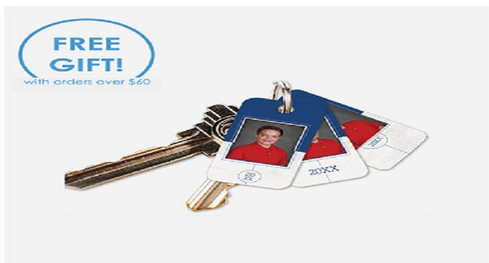
FREE GIFT WITH PURCHASES $60+