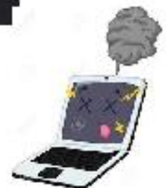
Almost any damage