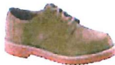
Sperry - Tevin Dirty Buck