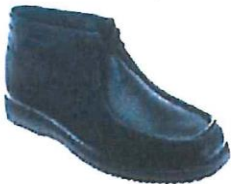
Bridgeport - Black Leather