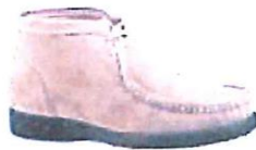
Hush Puppies Bridgeport - Taupe Suede