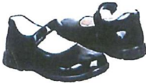
Primigi - Andes / Azalea Available in Black