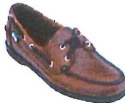
Sebago - Schooner Brown