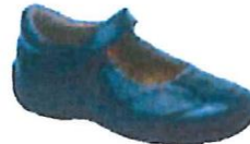
Stride Rite - Carla Available in Brown, Black or Navy