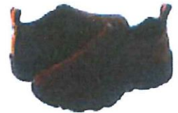
Merrell - Jungle Moc Available in Brown or Black